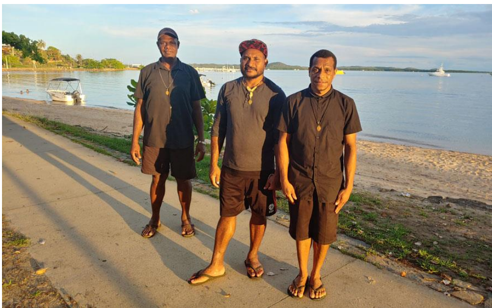
Melanesian Brothers in the Torres Strait

The light of Christ, which shines so brightly in the far north of Australia, needs to be shared.