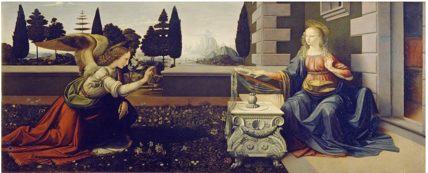
The Annunciation Leonardo da Vinci