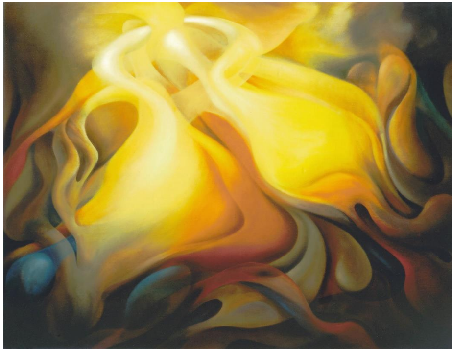
Transfiguration of Jesus by Armando Alemdar Ara

Last Sunday after Epiphany - The Transfiguration