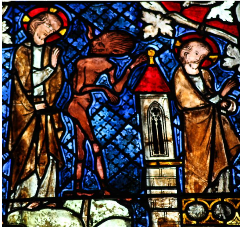
Strasbourg Cathedral - Stained glass windows - Detail