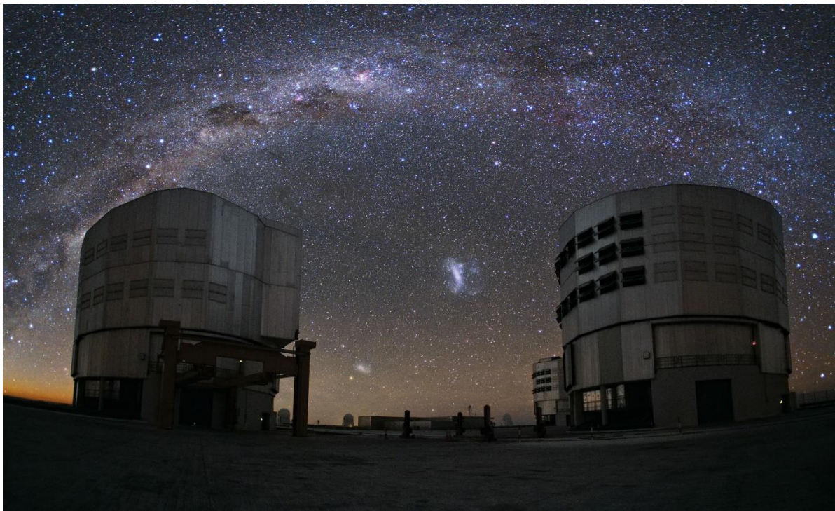
An Emu in the Sky over Paranal