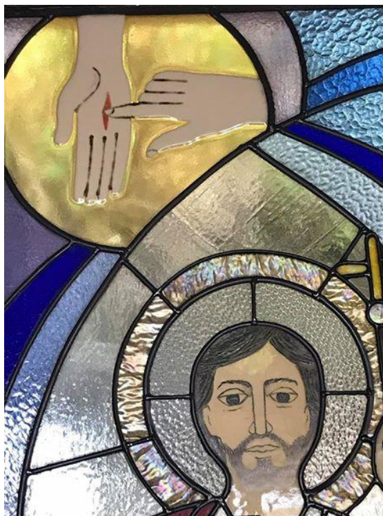
Detail, Window, St Thomas Anglican Church Cardiff, NSW.