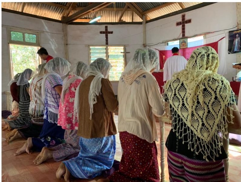
Anglican worshippers in Myanmar

We offer the following prayer for Myanmar God of the still small voice of calm, We pray for concord and peace in Myanmar.