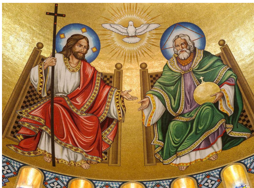
Detail from the Trinity Dome in the Basilica of the National Shrine of the Immaculate Conception in Washington DC.