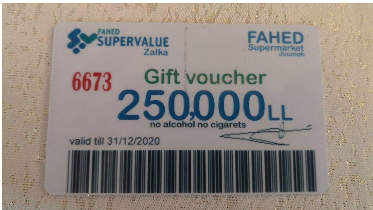
PHOTO: One of the food vouchers given to people affected economically by the explosion.

Uncoming dates: The Coming of The Light – 1 July 2021 NAIDOC Week – 4 to 11 July 2021