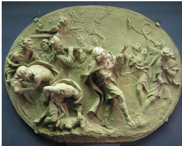
David dancing before the Ark. Victoria and Albert Museum