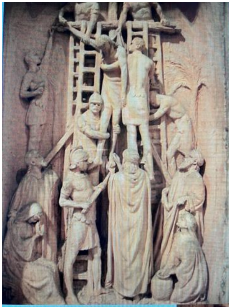
One panel – All misery past

It was purchased by the Dean & Chapter in 1916 and held in storage. When the St Michael Chapel was proposed, it was determined that the panels be used as the central reredos in the apse construction, and it was built into the commissioned marble surrounds as an integral part of the Chapel's fabric. *