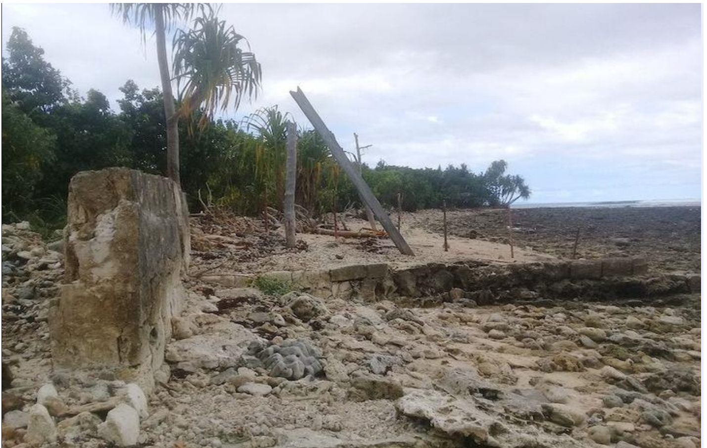
Photo: Sea-water incursion devastates Fanalei Coastal Community in South Malaita in the Solomon Islands