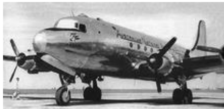
The Douglas DC-4 Amana, the aircraft destroyed in the accident.