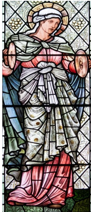
Rejoice Daughter of Zion