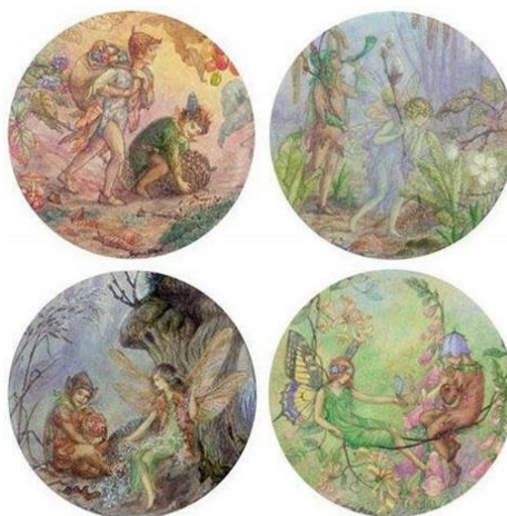
Some examples of her art