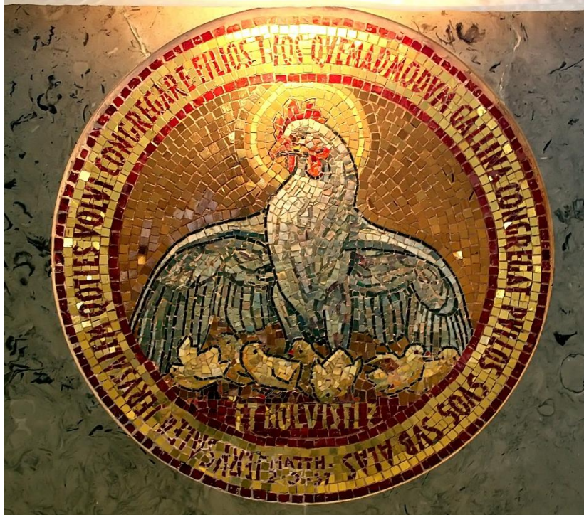
Caption: Mosaic Art at Dominus Flevit