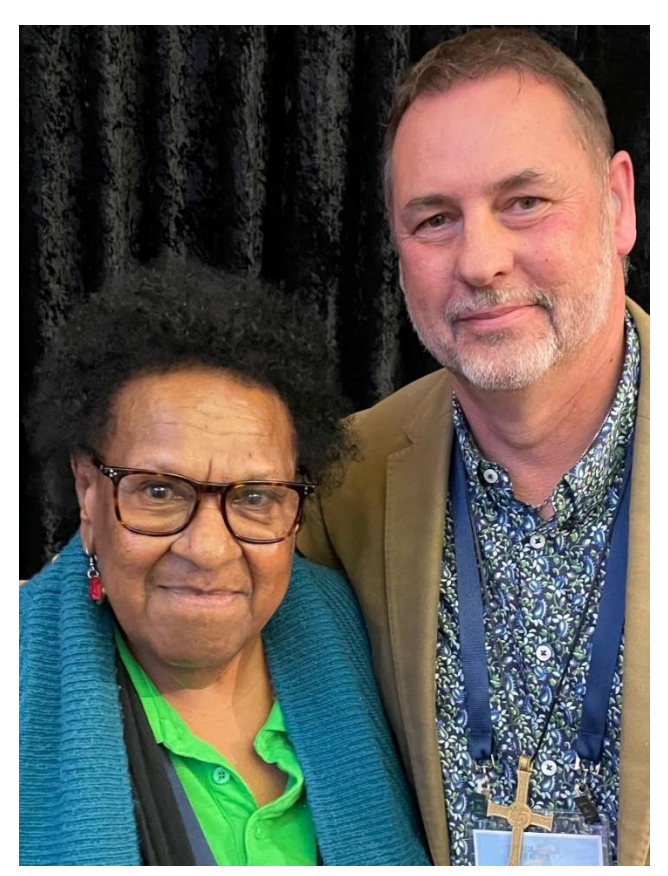
Photo: Parishioners at Holy Trinity Launceston raising funds for ABM.

We could certainly not do what we do without you.