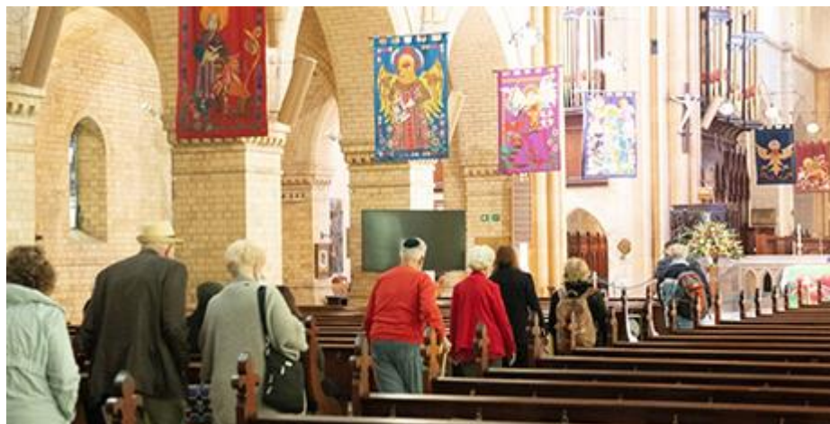
Church crawl participants visit Christ Church Cathedral in Newcastle

Ps: Please share this email with others who would like to hear news of the parish. To receive our weekly mailings, please contact the Cathedral Office cathedral@newcastlecathedral.org.au to be placed on the email or mail out list.