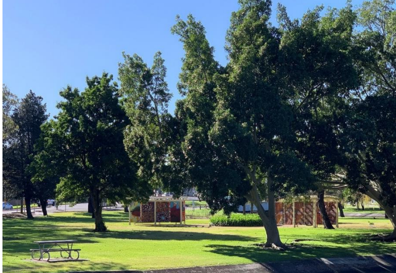
City of Newcastle Peace Park, Maitland Rd, Tighes Hill Parking available off Tighes Terrace

Celebrate the designation of the Peace Park by the City of Newcastle and share a picnic lunch with barbecue provided or BYO lunch