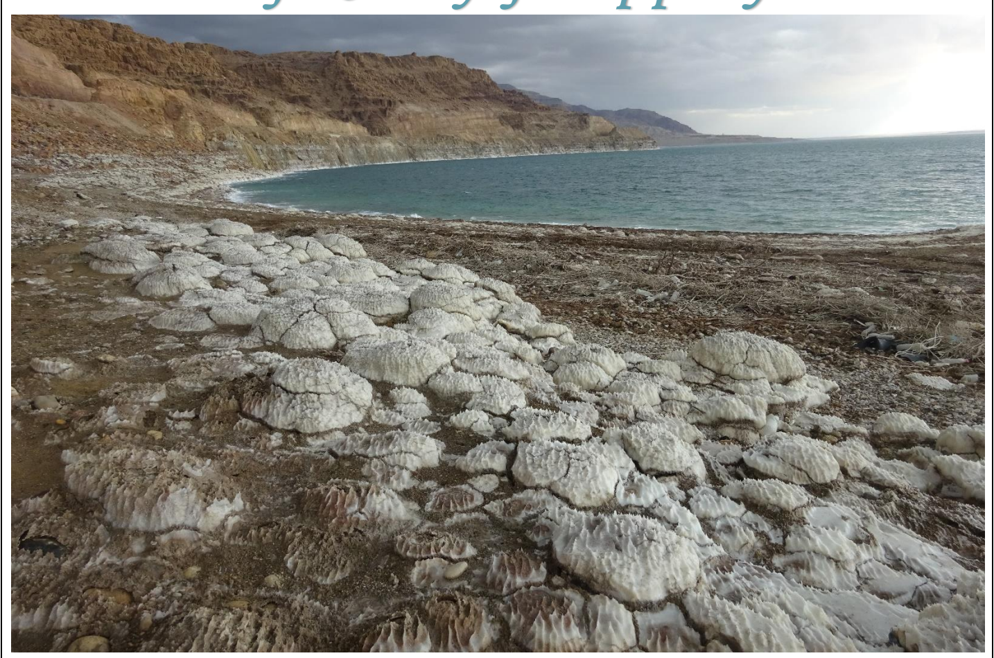
Salt, Dead Sea, Jordan.

Weekly News Sunday 5 February Fifth Sunday after Epiphany