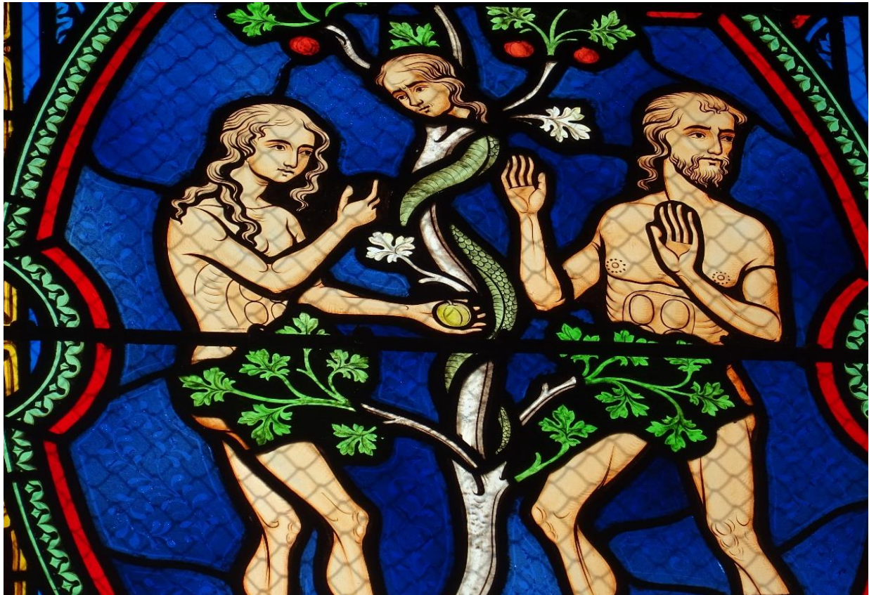
Stained glass window Adam and Eve, the fruit, and the serpent, in the Garden of Eden. In the Basilica of Our Lady of the Children in Châteauneuf-sur-Cher, France.

Welcome to worship today, especially all who are visiting Weekly News Sunday 26 February First Sunday of Lent