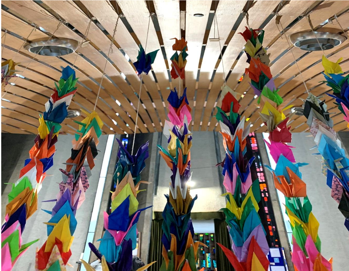
Chapel of Unity, Coventry Cathedral: Origami Cranes