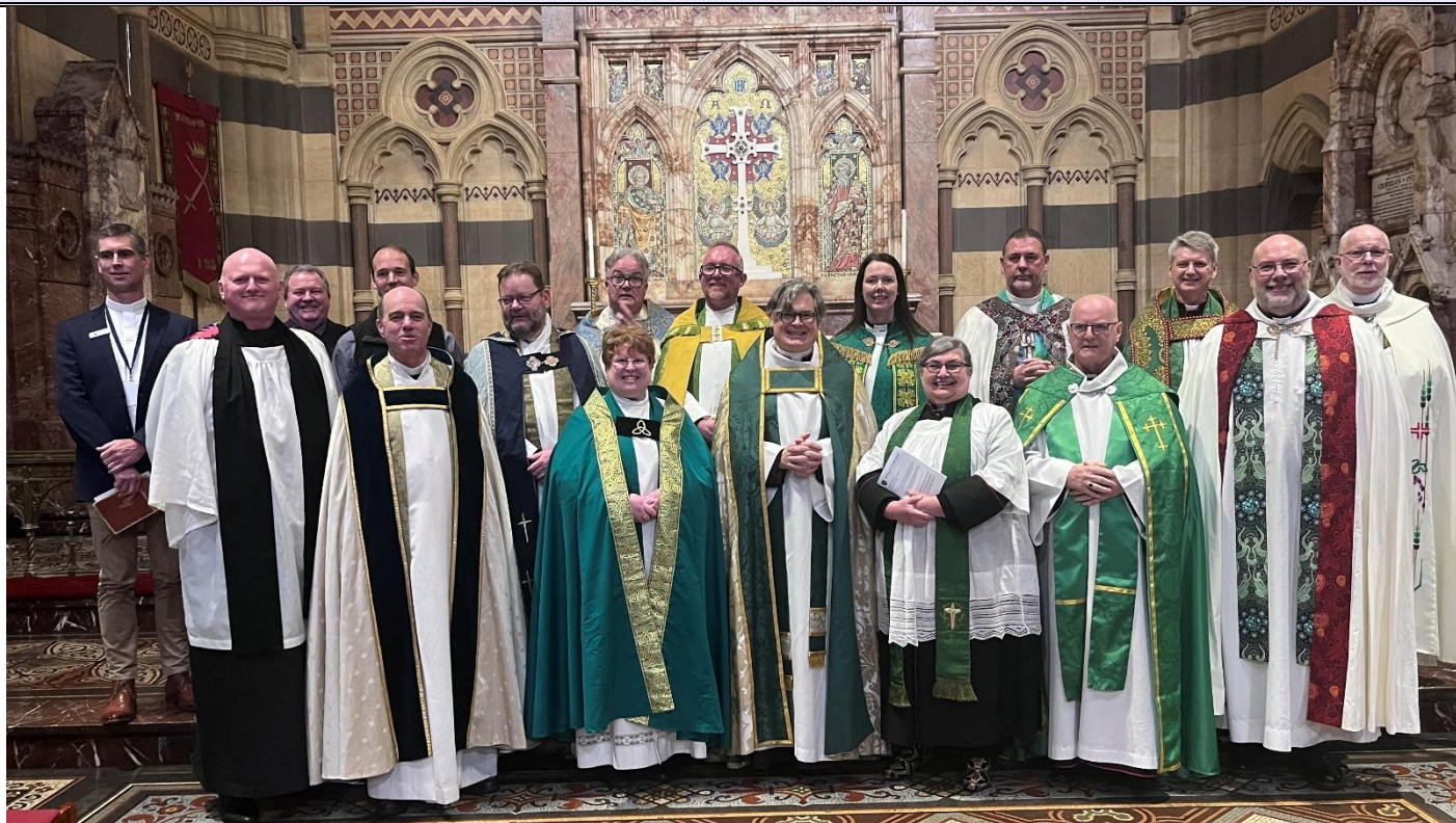
A photo of almost all the Anglican Deans who attended the annual Deans' Conference, hosted by St Paul's Cathedral Melbourne.