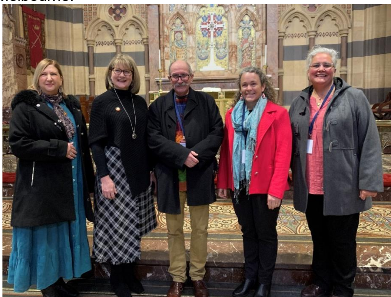
A photo of some of the spouses at the Deans' Conference.