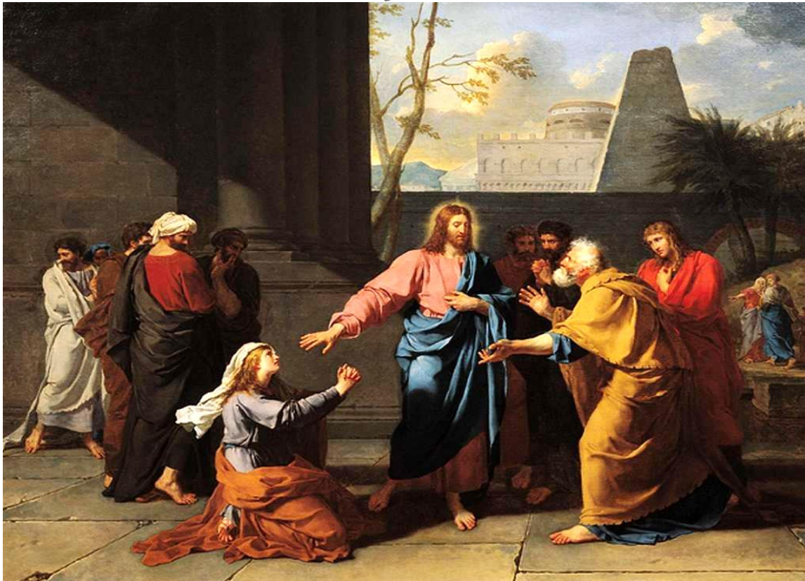
Jean Germain Drouais - Drouais Cristo e la Cananea