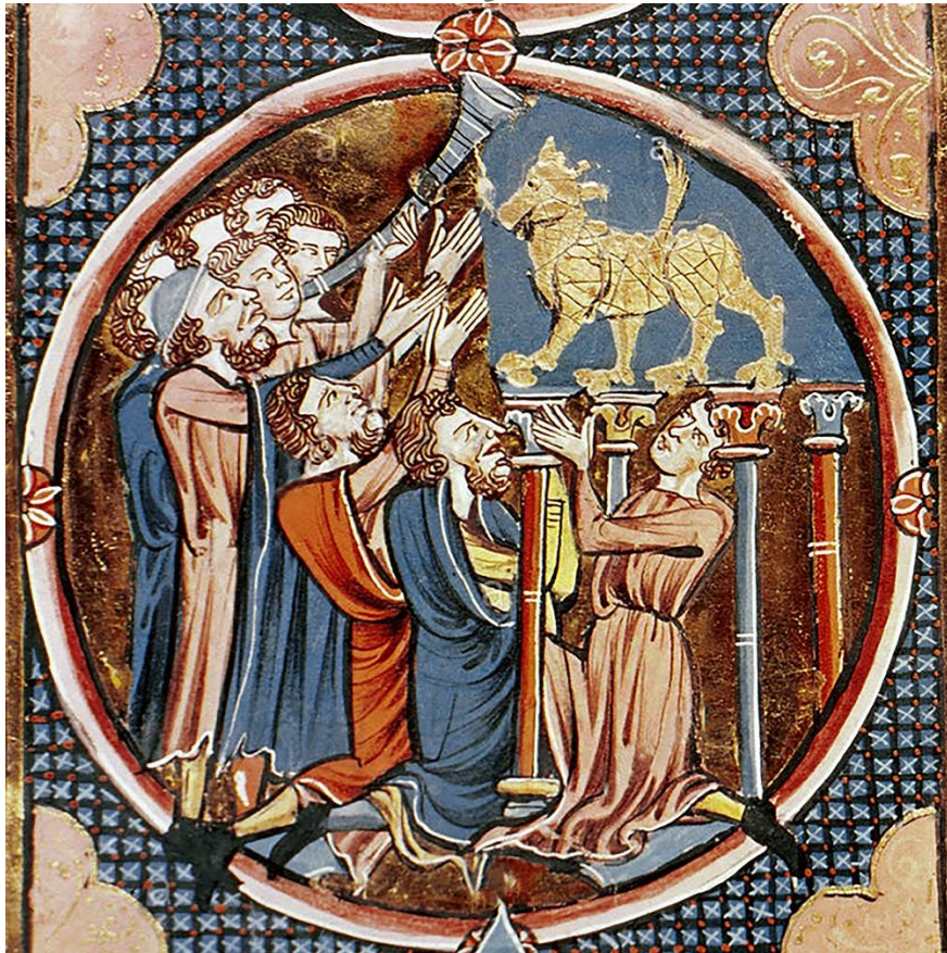
Caption: Photo credit Levan Ramishvili: Worshipping Golden Calf, Miniature of Saint Louis Bible, c. 1227-34