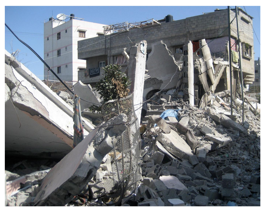
Al-Ahli hospital.

AID has launched an emergency appeal for the Al Ahli Hospital in Gaza. Devastating news. Hundreds killed in strike on the Al-Ahli Hospital in Gaza. Having already dealt with being hit by rockets on Saturday evening leaving four people injured, there has now been a fatal strike on the Al Ahli Arab Hospital. Initial estimates suggest the death toll is at least 200 people, but possibly more than 500 people have been killed.