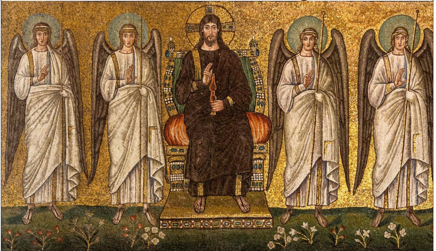
Basilica of Sant'Apollinare Nuovo in Ravenna (496-526).

Welcome to worship today, especially all who are visiting Weekly News Sunday 26 November 2023 Feast of Christ the King