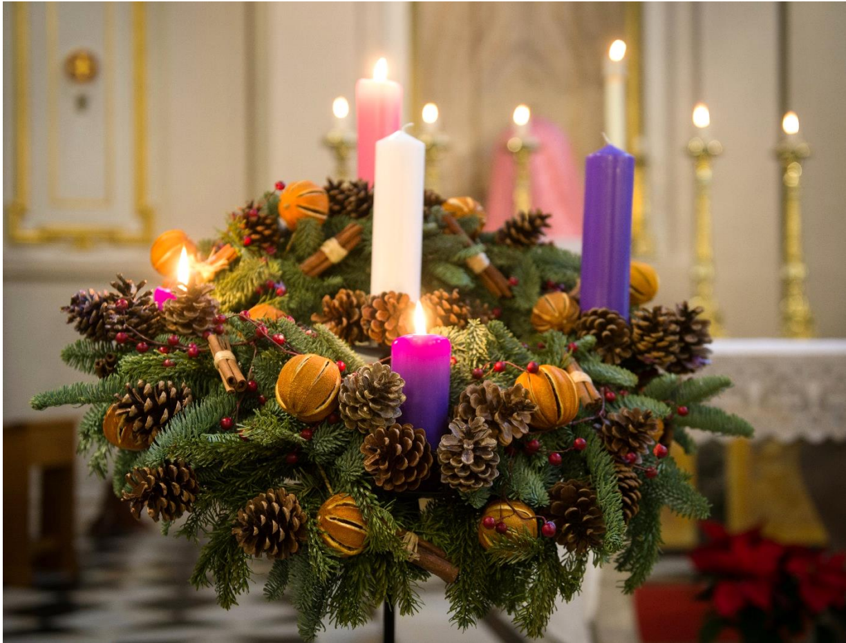
Gaudete Sunday, Our Lady of Grace & St Edward