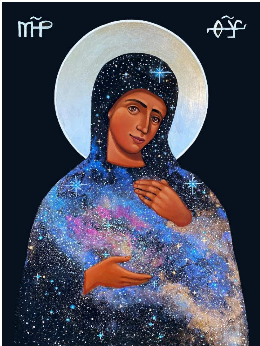
Mary: Love Forever Being Born