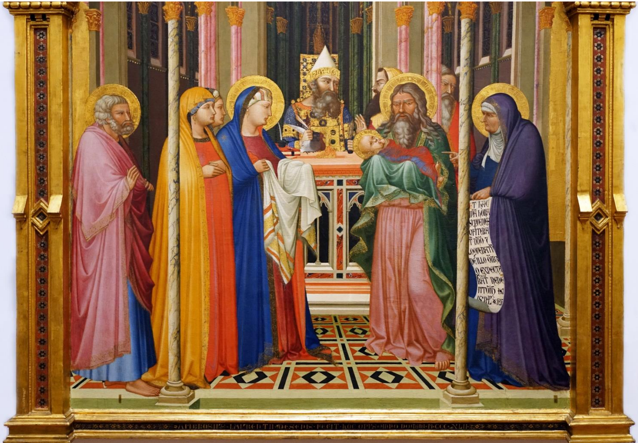
Artist: Ambrogio Lorenzetti, Presentation at the Temple, 1342.