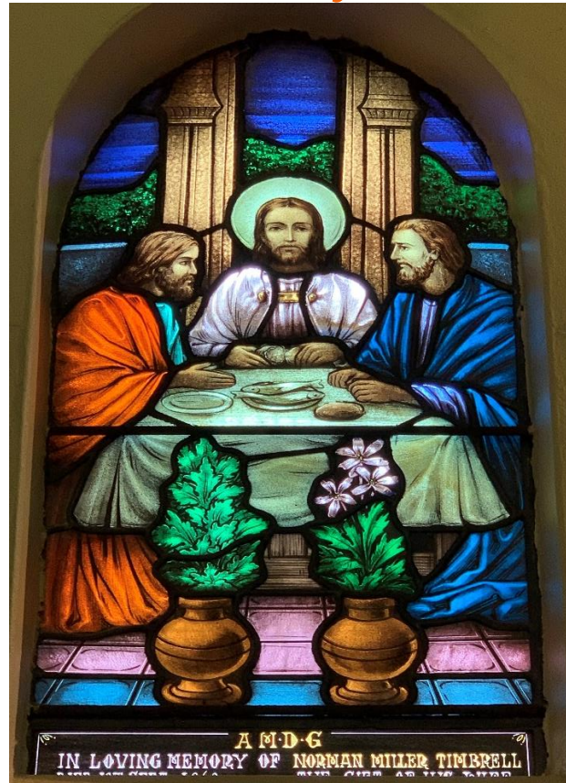
Window St Peter's Hamilton