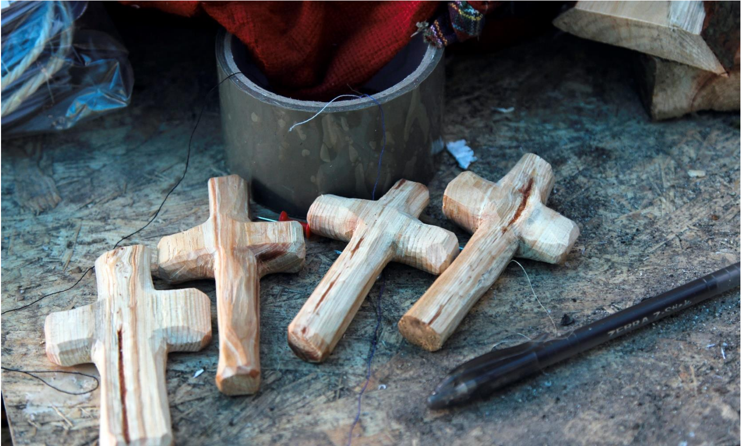
Crosses carved by Rover Scouts of Europe August 2015.