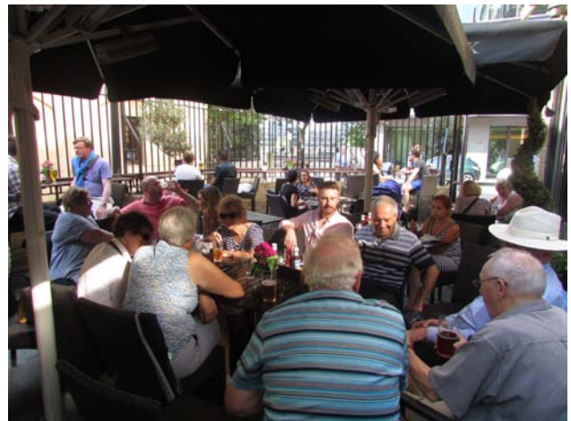
Above left: The choir in action during Evensong at Southwark Cathedral, and right, showing that we also know how to relax!!