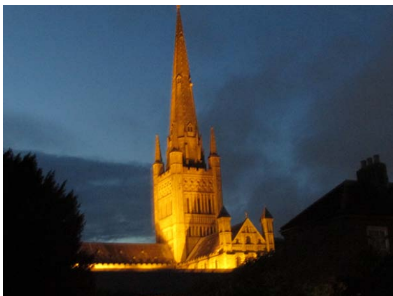
Left: Norwich's immense spire lit amongst the peace and calm of the English evening.