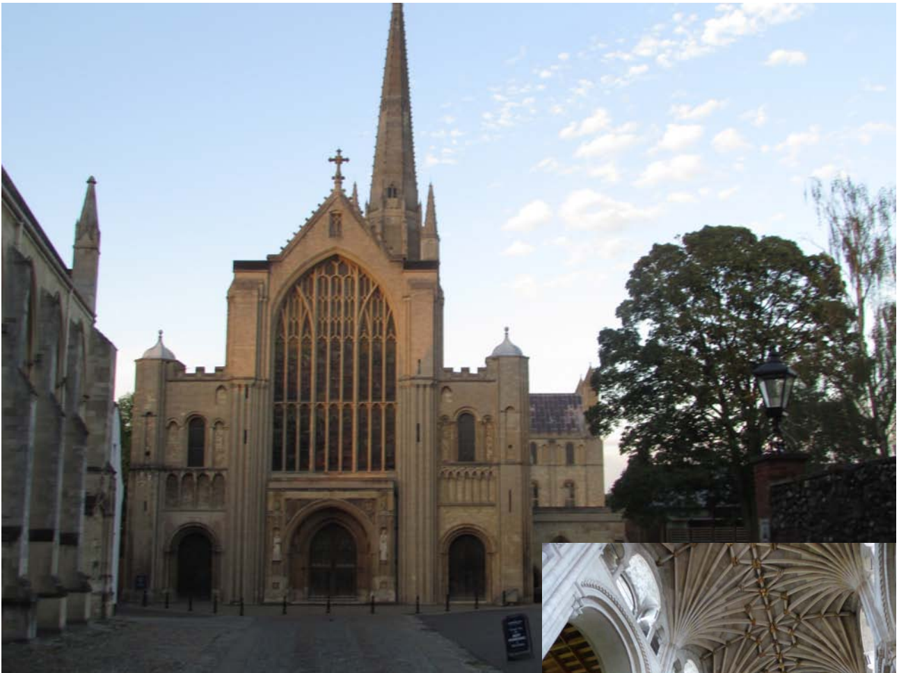
Above: Norwich Cathedral West End

Norwich cathedral is older than Southwark. The stones underfoot are smoothed by the passing of almost a millennia of the faithful, and the once-sharp angles of pillar and corner are softened with time. Norwich was once home to Benedictine monks, who kept the daily patterns of prayer and reflection, and the cathedral is still primarily a place of prayer, a place of stillness and reflection — and the busyness of rehearsals — in the midst of the bustle of a medieval city. We sang in the quire, behind the rood screen, where for almost a thousand years people have prayed and sung; we heard in the daily prayers the year's mind of monks centuries-dead. We saw a stained glass window pieced together from the mere fragments which survived the Reformation and the religious battles of the sixteenth century. And again, we sang the music of our heritage, old and new, and we were welcomed into the fabric of the community of the cathedral, and we prayed with them.