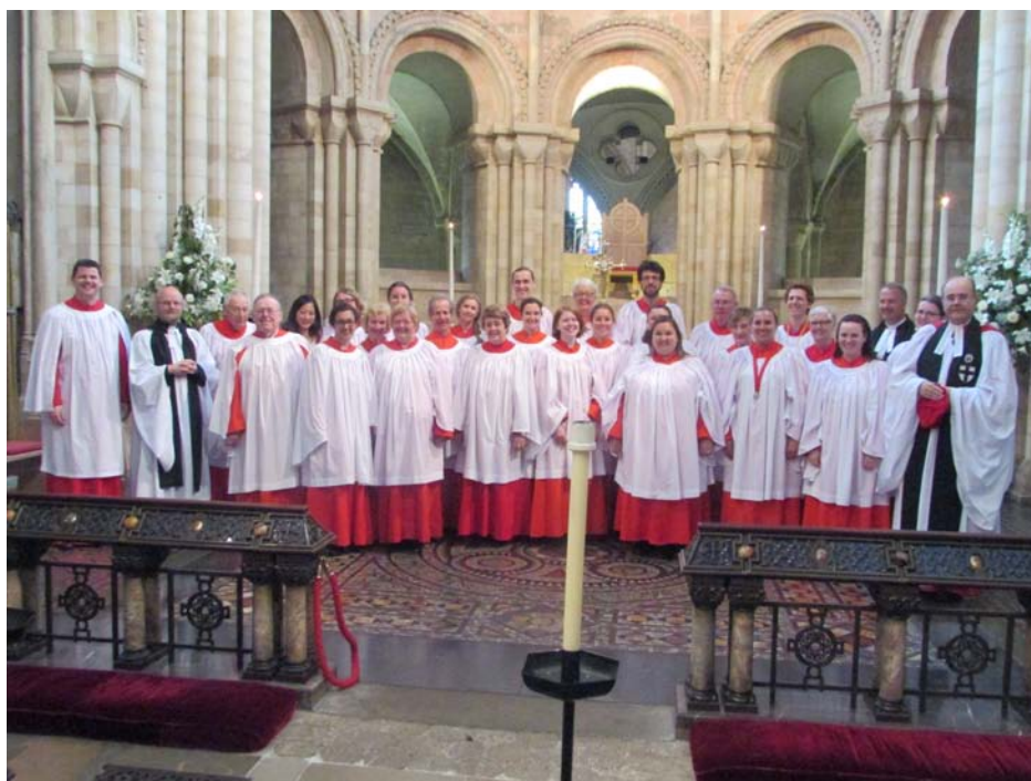
The Choir at Norwich Cathedral following our final Evensong, with the Canon Precentor, Canon Librarian and Canon Pastor of the Cathedral.