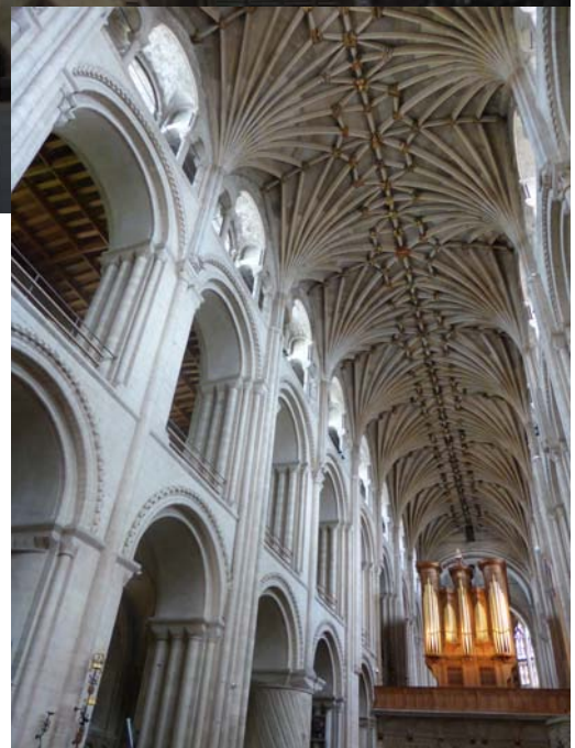
Right: The organ and vaulted ceiling from the western end of the Nave.